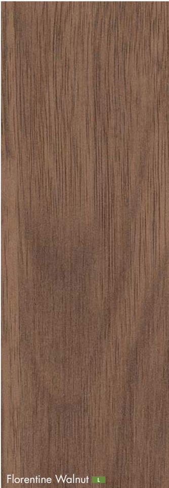
Florentine Walnut L