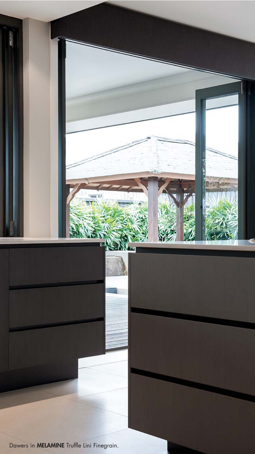
Dawers in MELAMINE Truffle Lini Finegrain.